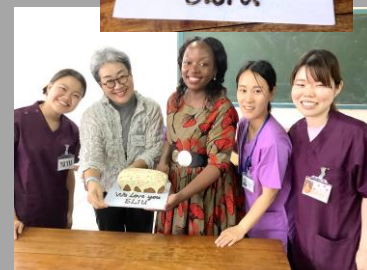
Group photo and the welcome cake shared by participants during the break.